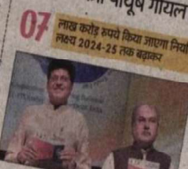
07 लाख करोड़ रुपये किया जाएगा निर्यात लक्ष्य 2024-25 तक बढ़ाकर

नई दिल्ली। वर्ष 2022 तक किसानों की आय दोगुनी करने का लक्ष्य धरने के लिए सरकार ने कृषि उत्पादों का निर्यात बढ़ाने की योजना बनाई है। केंद्रीय उद्योग एवं वाणिज्य मंत्री पीयूष गोयल और कृषि मंत्री नरेंद्र सिंह तोमर ने मंगलवार को कहा कि विदेश मंत्रालय के साथ मिलकर यह लक्ष्य पूरा किया जाएगा। सरकार ने तय किया है कि वर्ष 2024-25 तक कृषि उत्पादों का निर्यात बढ़कर 7 लाख करोड़ रुपये किया जाएगा, जो अभी कृषि क्षेत्र के लिए 2.75 लाख करोड़ रुपये तक है। गोयल और तोमर ने कहा कि इसके लिए सरकार कई जोतों पर एक साथ काम कर रही है। इनमें बेहतर खाद-बीज और दुर्लभ उपकरणों के जीवित उपज में बढ़ावा देने के साथ ज्यादा कृषि उत्पादों के निर्यात के लिए बुद्धिमत्तापूर्ण उपाय शामिल हैं। अभी देश में 15 लाख सहकारी संस्थाएँ चल रही हैं, जिसमें करीब 94 फीसदी किसान जुड़े हैं। यह संख्या 15 करोड़ के आसपास हो जाती है। यूरे