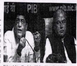
Union ministers Piyush Goyal (left) and Narendra Singh Tomar at the curtain raiser on 'The First Ever India International Cooperatives Trade Fair' in New Delhi on Tuesday

The government has announced that an export-promotion forum for the cooperative sector will be created soon. An international trade fair will also be organised on October 11-13. The forum will be set up under the National Cooperative Development Corporation (NCDC) after consultations with 20 states and three Union territories, said Commerce and Industry Minister Piyush Goyal and Agriculture Minister Narendra Singh Tomar on Tuesday.