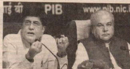
Union ministers Piyush Goyal (left) and Narendra Singh Tomar at the curtain raiser on "The First Ever India International Cooperatives Trade Fair" in New Delhi on Tuesday

The government hopes this will work as an exchange platform for the cooperatives. Both