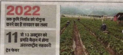
2022 तक कृषि निर्यात को दोगुना करने का है सरकार का लक्ष्य 11 से 13 अक्टूबर को प्रगति मैदान में होगा अंतरराष्ट्रीय सहकारी ट्रेड फेयर