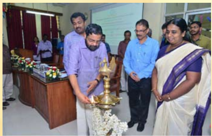
Minister is Lighting Lamp for inauguration

The State Level Selection Committee (SLSC) met under the chairmanship of RCS, Kerala on 25-10-2018, and selected 8 Primary cooperatives, from 4 different sectors for the NCDC Regional Awards for Cooperative Excellence and Merit, 2018 for Primary Cooperatives. The societies are: