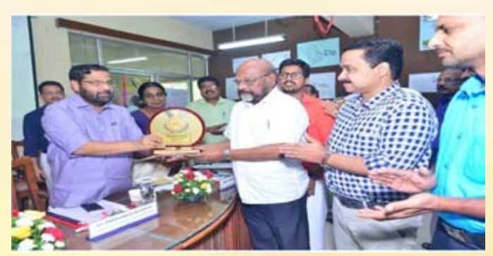
Award to Calicut Service Coop Bank