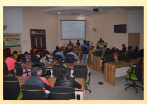
2. कार्यक्रम समारोह में महानुभावों की गरिमामयी उपस्थिति।