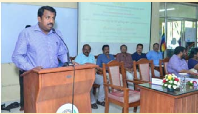
Address by RCS