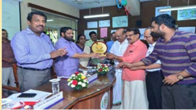
Award to Cherpulassery Coop Hospital