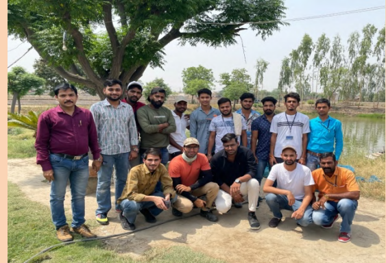
Study visit at Royal Fish Farm, Dabra, Haryana on 07 May, 2022