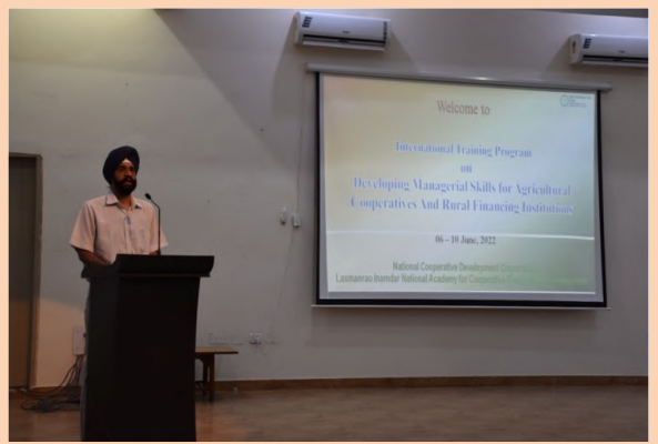
Inauguration of the Program on 6 June, 2022

A five-day on campus International Training Program on Developing Managerial Skills for Agricultural Cooperatives and Rural Financing Institutionswas organized by LINAC-NCDC in collaboration CICTAB, Pune, during 6-10 June, 2022 at LINAC, Gurugram. A total of 11 participants from 3 countries namely- Bangladesh, Nepal and India participated in this training program. Apart from sessions, study visits to Ujoli Primary Cooperative Society, Alwar and to DCCB, Gurugram and a cultural visit were also organized for the participants.