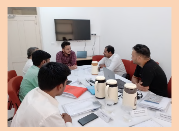
Discussions between Resource Person and Incubatee

A two-week long second phase of 1<sup>st</sup> Batch of Training Program of LIFIC, Gurugram was conducted during 30 May – 10 June, 2022. A total of 10 incubatees attended the first phase of 1<sup>st</sup> batch. However, out of 10 incubatees, only 6 incubatees attended the second phase. These 6 incubatees were from 4 states namely- Maharashtra, Gujarat, Bihar and Himachal Pradesh. Two-week long second phase enabled the incubatees to finalize their Detailed Project Reports and ultimately open their FFPOs.