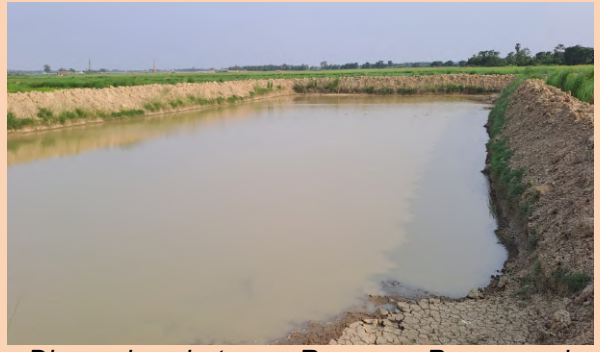
Discussions between Resource Person and Incubatee