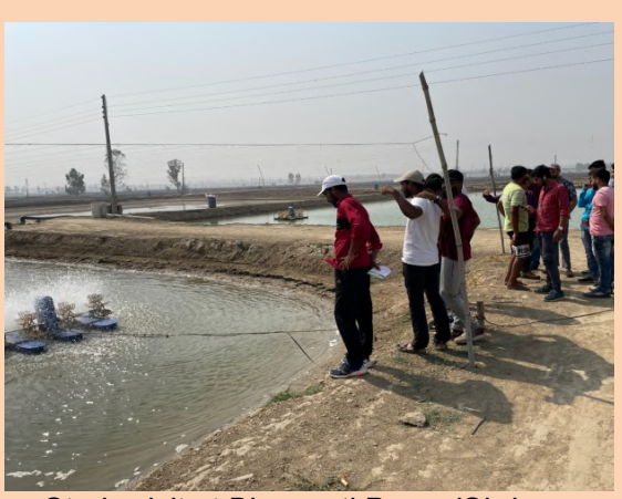
Study visit at Bhagwati PrasadShrimp Farm, Kalayat, Haryana on 08May, 2022