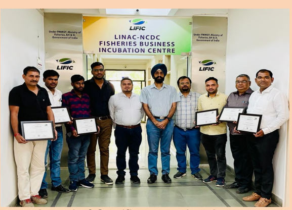
Award of Certificates to Incubatees