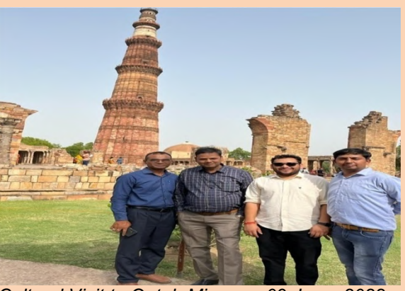
Cultural Visit to Qutub Minar on 09 June, 2022