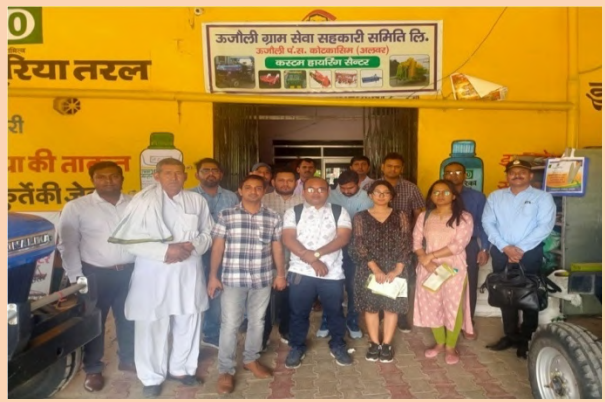
Study Visit to Ujoli Primary Coop. Society, Alwar, Rajasthan on 07 June, 2022