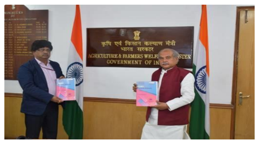
Union Agriculture Minister visited NCDC

सहकार प्रज़ा (SAHAKAR PRAGYA) — "Capacity Development of Primary Cooperatives" through 18 Regional Training Centers of NCDC-LINAC and 45 Cooperative Business Training Modules were unveiled by Shri Narendra Singh Tomar Ji, Hon'ble Union Minister of Agriculture and Farmers' Welfare on 24 November 2020. Sahakar Pragya embodies enhancing NCDC's training capacity through an elaborate network of 18 Regional Training Centres (RTCs) across the country with 45 new training modules. These 45 training modules of Sahakar Pragya to be delivered at LINAC and its countrywide network of RTCs will address the need for training of Primary cooperatives, FPO-Cooperatives and Self Help Groups federation.